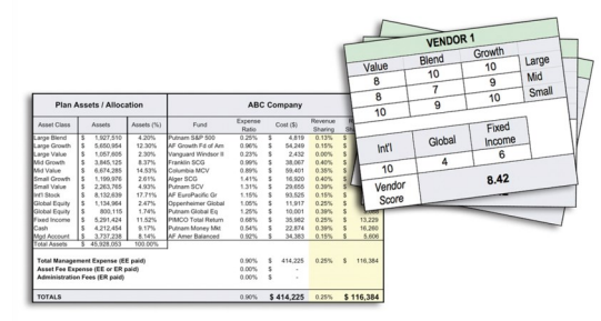
Sample Total Cost Analysis and Vendor Investment ScoreCard <sup>SM</sup> Excerpt

Sample Client Newsletter and Employee Memo